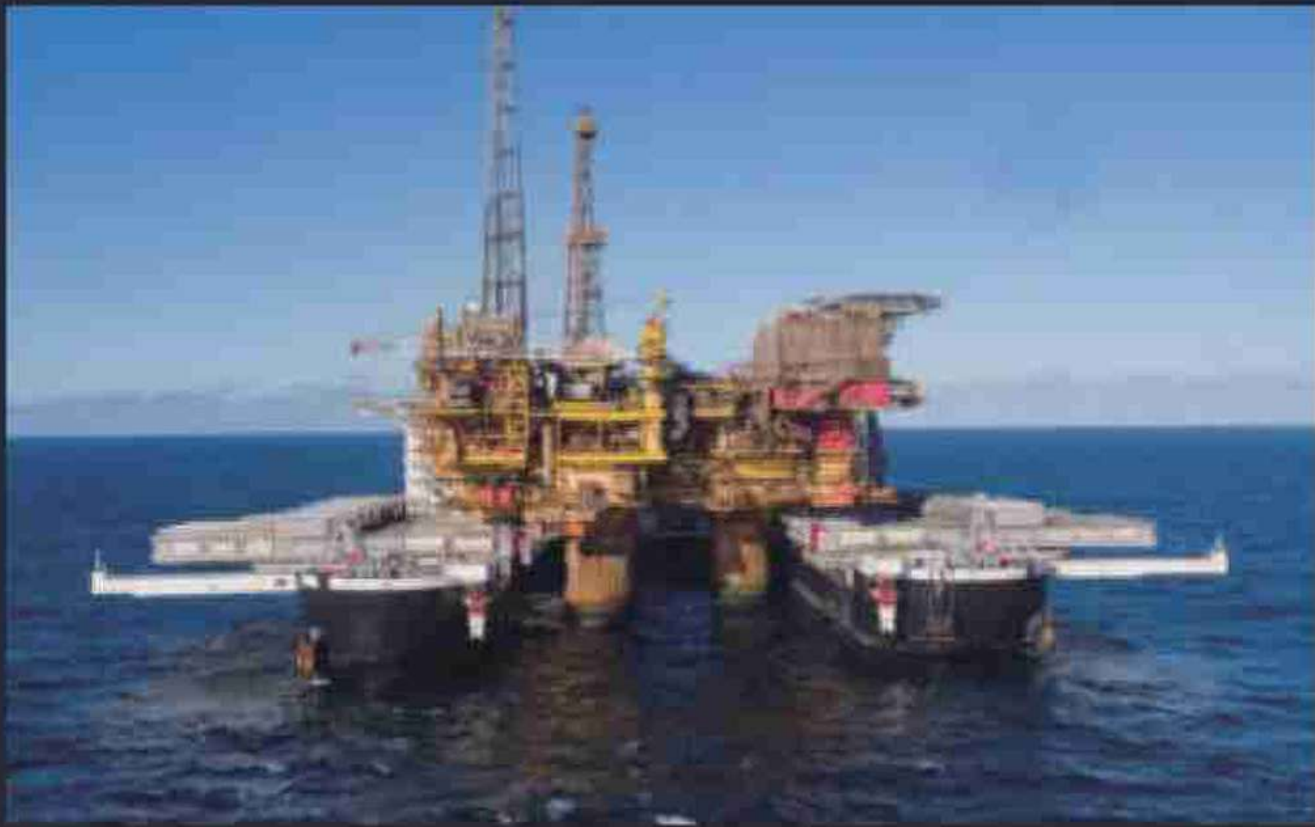
Oil & Gas Platforms