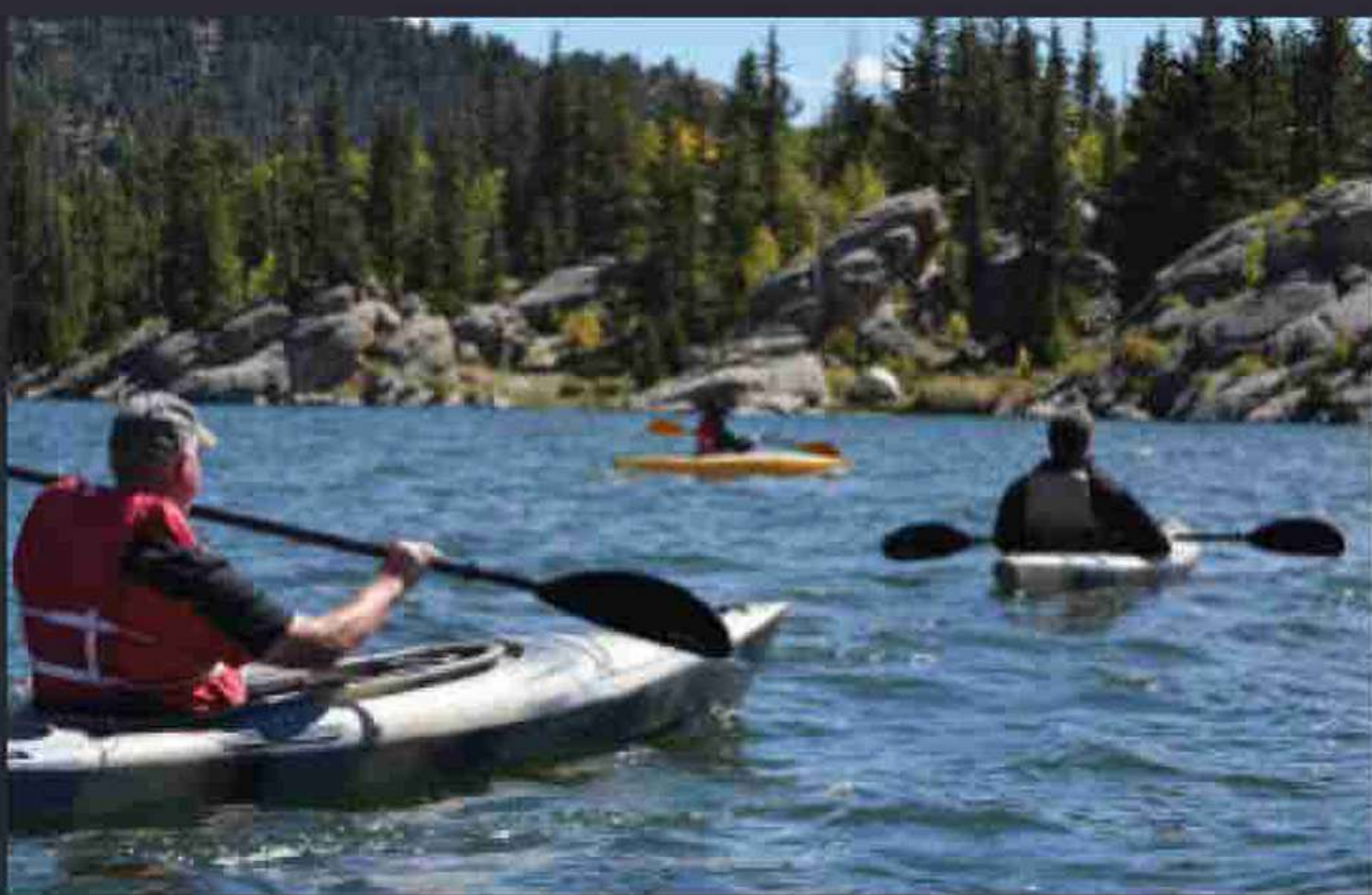
Lakes, Rivers, Reservoirs